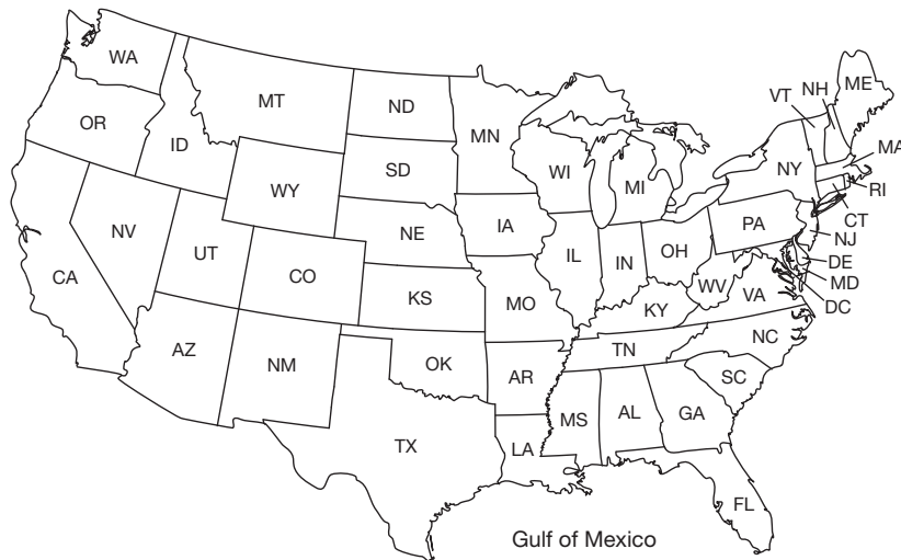
48 States in the Continental United States

Directions Study the following graphic source. Then answer the questions below.